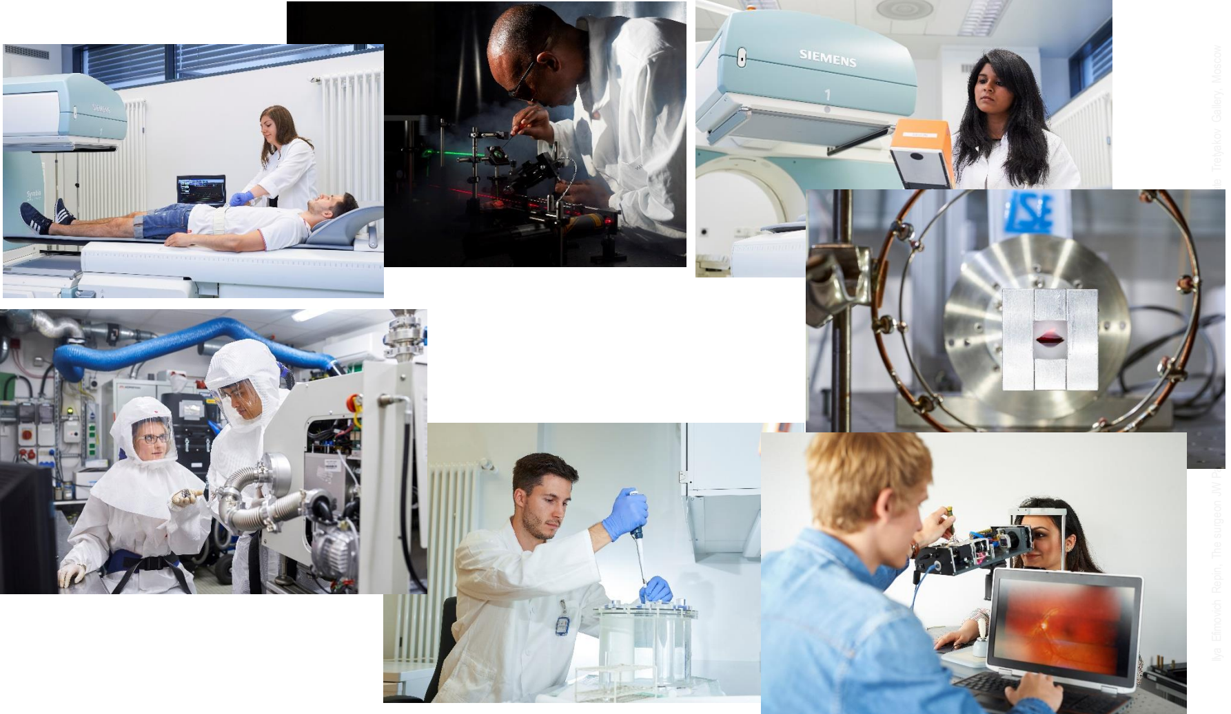
by: Tretyakov, Gallery, Moscow